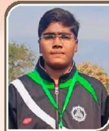
Avanti Talankar Athletic (ICAR+ MCAER)