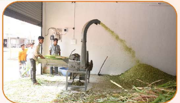
Celebration of Krishi Din