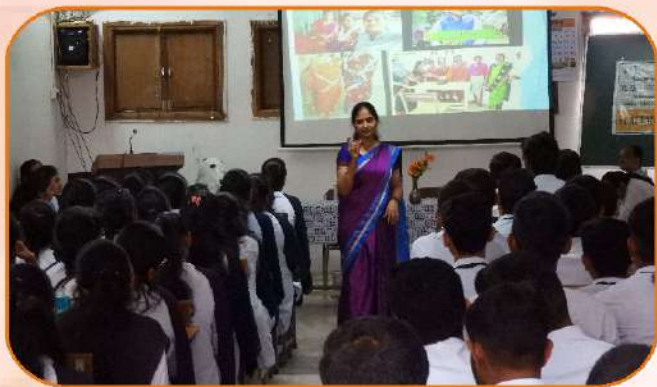
Seminar on Carrier Guidance and Opportunities