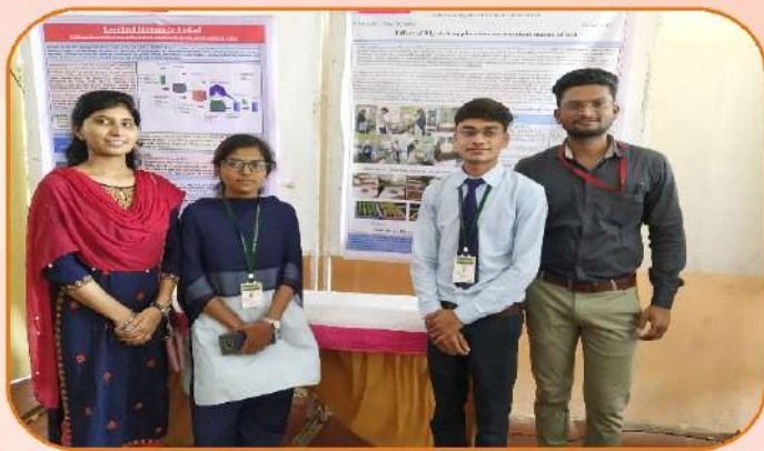
Participation in "Avishkar" held at Dr. P.D.K.V. Akola