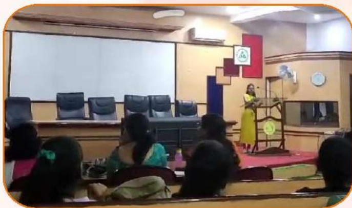
Participation in Inter University Youth Festival held at Dr. P.D.K.V. Akola