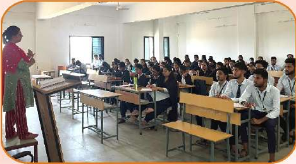
Agril. Economics Section