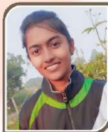
Gauri Mirzapure Athletic (MCAER)