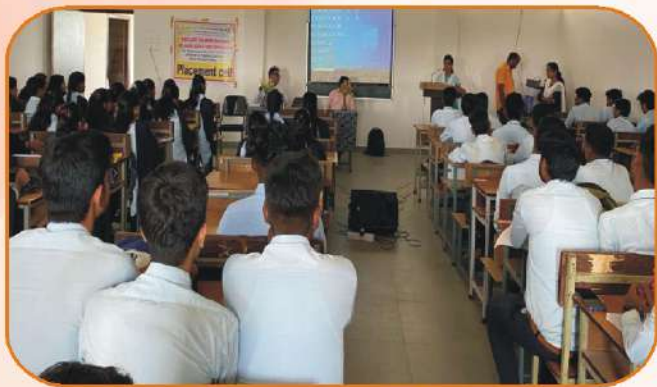
Guidance Programme - Rubicon Soft Skill Development Pvt. Ltd. Pune