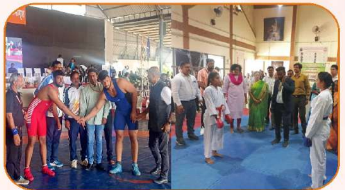
Wrestling & Karate