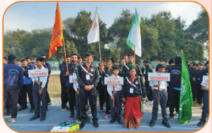
Participation College Students in Inter University Tournament at ICAR, New Delhi