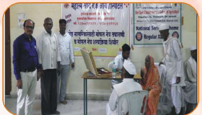
Eye Checkup Camp