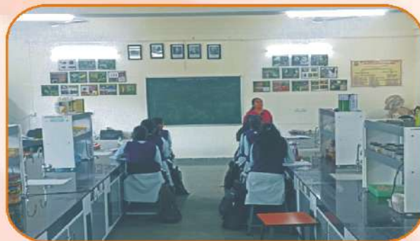
Agril. Entomology Section