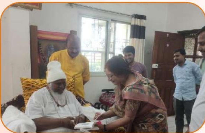
Publication Of Glossory Book On Economics