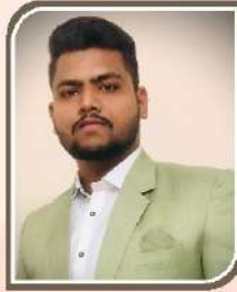
Ananta Pardakhe Wrestling (MCAER)