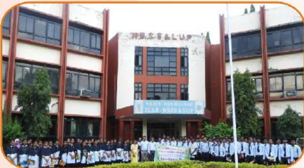
ICAR-NBBS & LUP, Nagpur