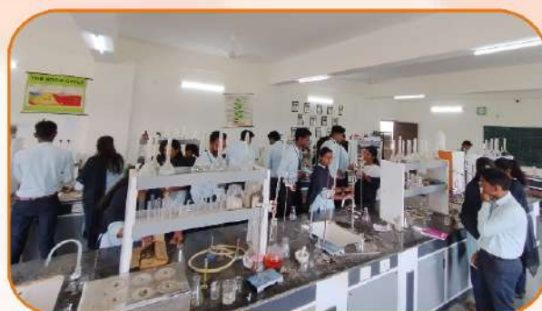
Soil Science & Agri. Chemistry Section