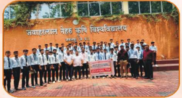
Jawaharlal Nehru Agriculture University Jabalpur, M.P.