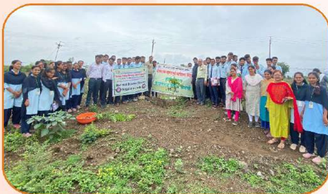
Tree Plantation Awareness Rally