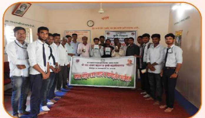
Distribution of Biofertilizer among farmers