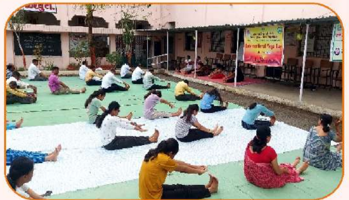
Celebration of Yoga Day