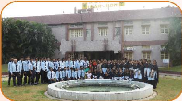
ICAR - Indian Institute of Oilseeds Research, Hyderabad