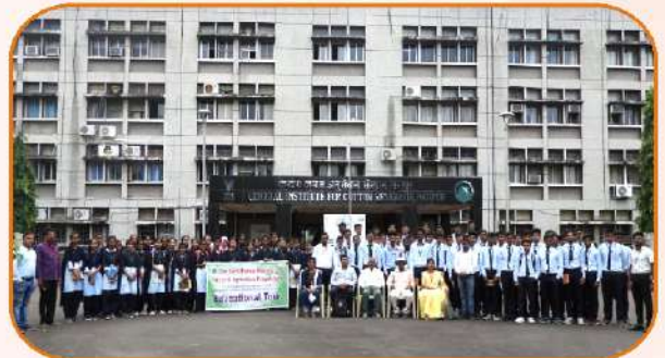
ICAR - Central Institute for Cotton Research, Nagpur