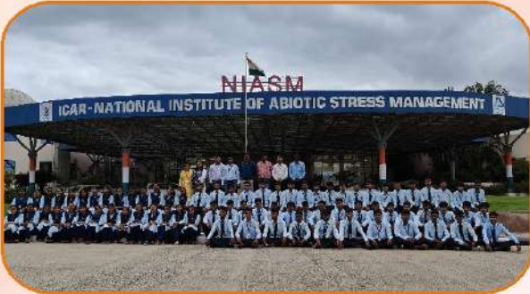
ICAR- National Institute of Abiotic Stress Management, Malegao Baramati