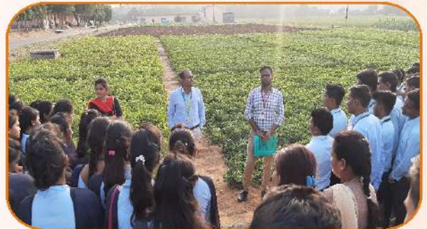
ICAR - Indian Institute of Oilseeds Research, Hyderabad