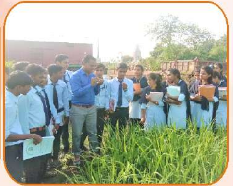
Emasculation and Pollination in Rice Crop