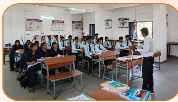
Agril. Engineering Section