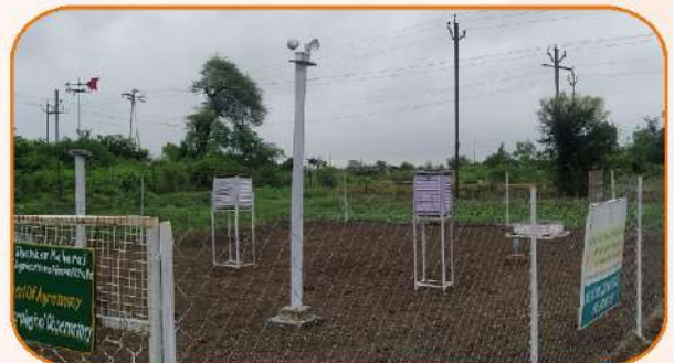
Agro Meteorological Observatory