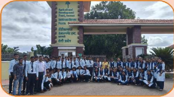
Krishi Vigyan Kendra, Baramati