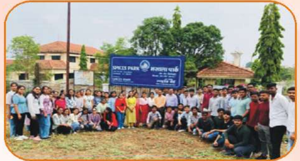
Spices Park Chhindwada, Spices Board (GOI) M.P.