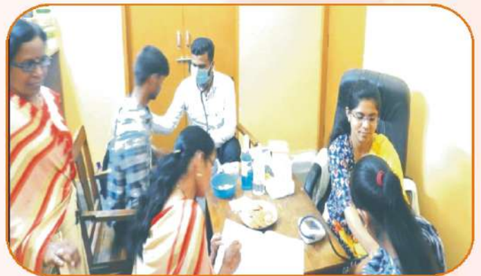
Health & Blood Checkup Camp organised by NSS Unit & Red Ribbon Club