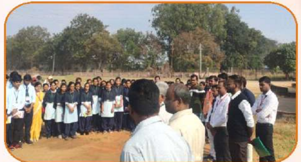
International Crops Research Institute for the Semi-Arid Tropics (ICRISAT) Hyderabad