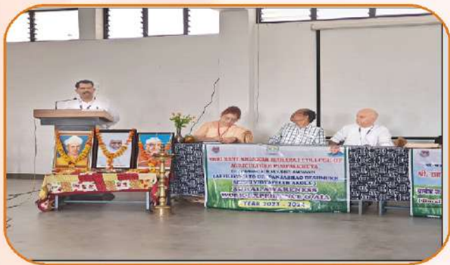
Seminar on Carrier Guidance and Opportunities