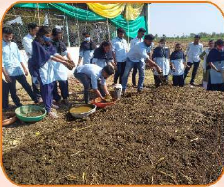
Preparation of Biodynamic Compost