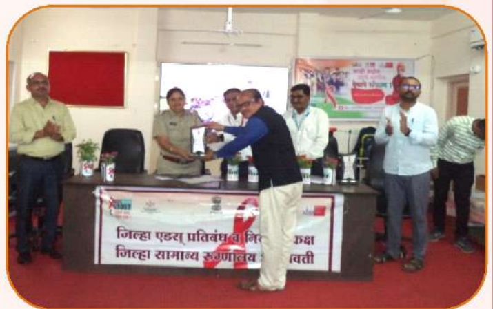
Best Red Ribbon Club Award by District Red Ribbon Club at Irwin Hospital Amravati