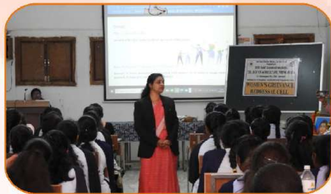
Seminar on Womens Well-Being and Flourishing