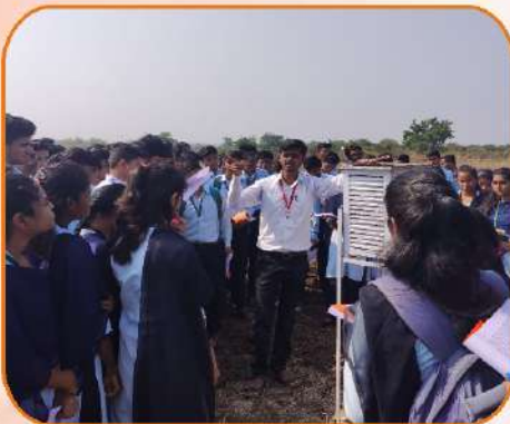
Providing Information about Agri. Meteorology