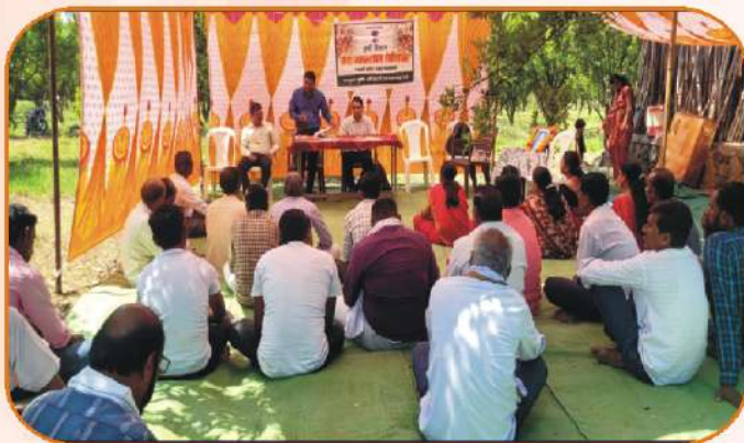
Farmer Guidance Programme