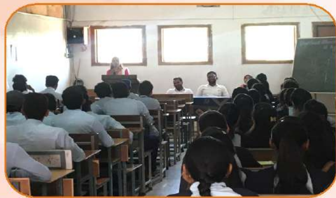
Seminar on ICAR, MCAER & Banking Examination