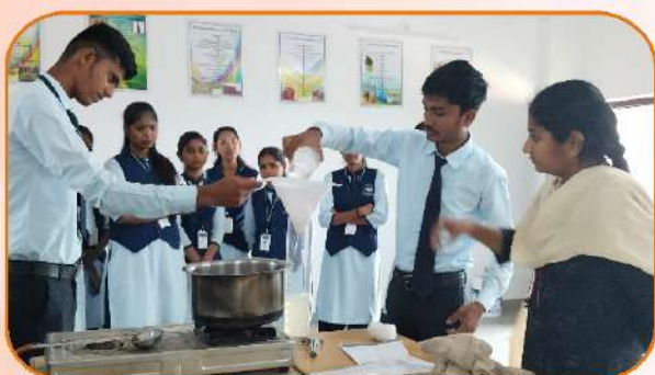
Plant Pathology Section