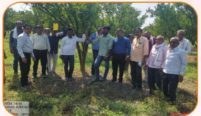
Visit to Farmer Field