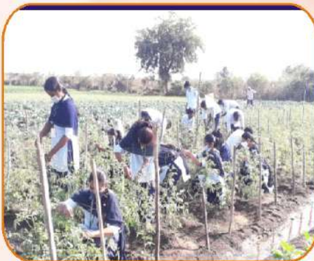
Stacking Operation in Tomato