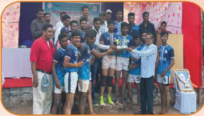
Kabaddi Team (Winner in Intercollegiate Sport Tournament 2023)