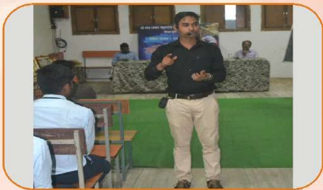
Seminar on MPSC Examination