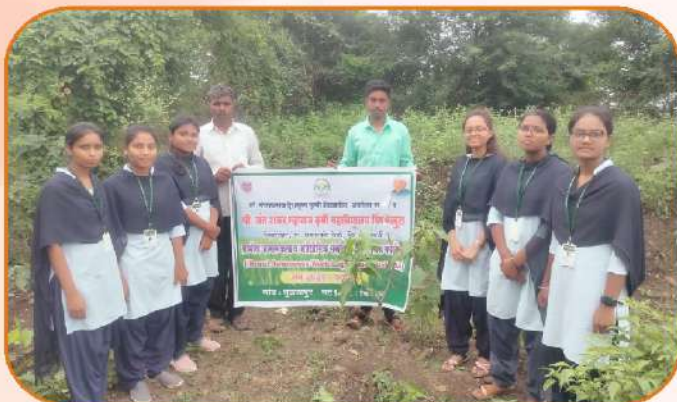
Visit of Farmer Field