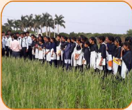
Providing Information about Agronomical Crops