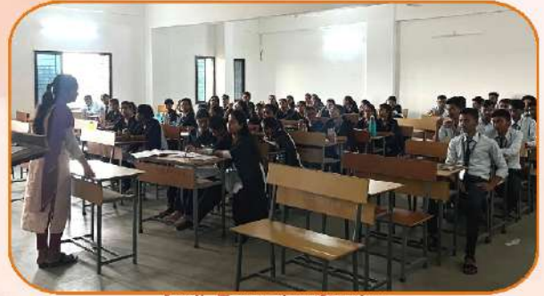
Agril. Extension Section