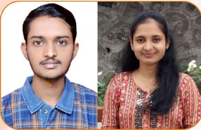
Secured 1 st Rank in Ph.D Entrance Examination in Maharashtra 2023 - 24