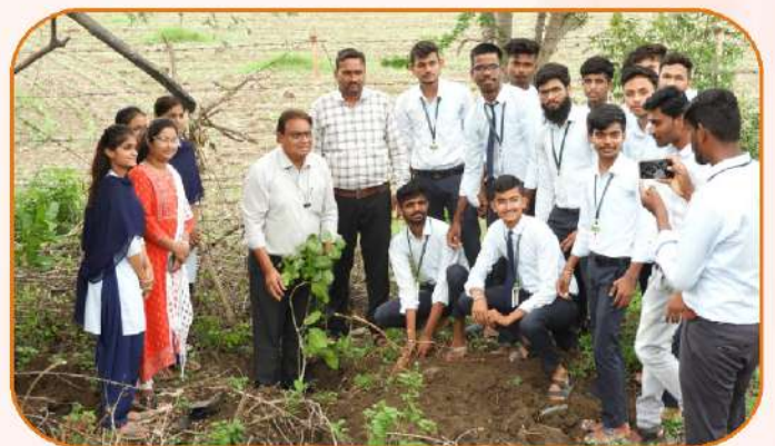
Tree Plantation by College Staff & Students