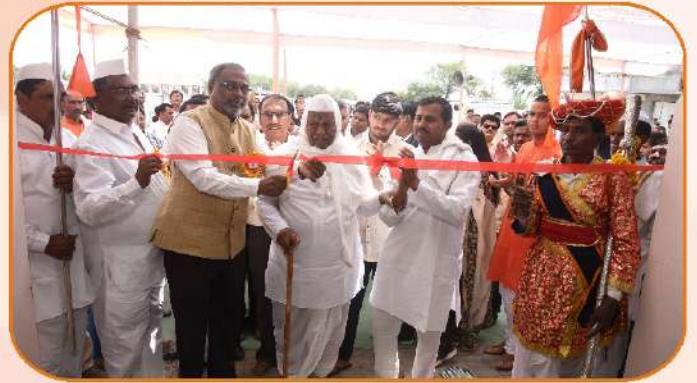
Workshop on Citrus Crop Management in Collaboration with Department of Agriculture M.S. and Dr. PDKV, Akola.