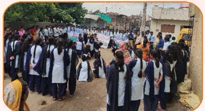
Celebration of Meri Mati Mera Desh Programme