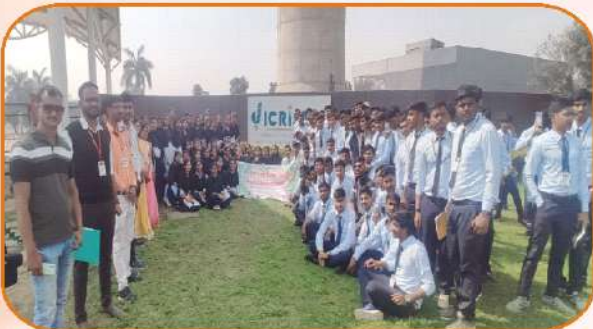
International Crops Research Institute for the Semi-Arid Tropics (ICRISAT) Hyderabad