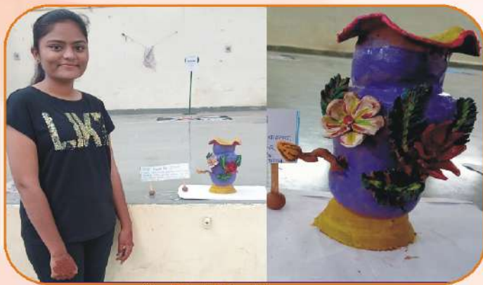
(2nd Rank) Play Art Participation in Inter University Youth Festival held at Dr. P.D.K.V. Akola