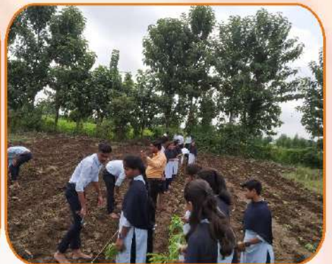
Plantation Operation in Flowers