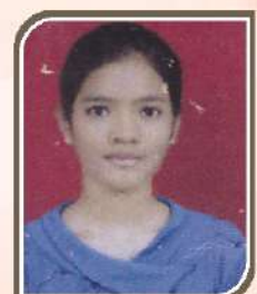
Achal Tekam Relay (Silver Medal)